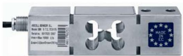
TEFLÓN® protects all the internal cables

Construction using stainless steel. The laser soldered closing protects from the typical environment in food and chemical industry. Mounting compatibility.