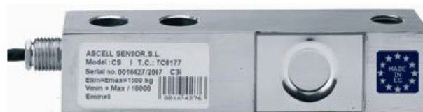
TEFLÓN® protects all the internal cables

Length of the cable is optional. Consult for special requirements.