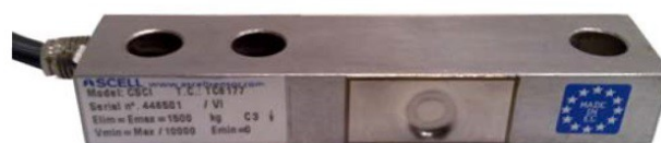
TEFLÓN® protects all the internal cables

OPTIONS Length of the cable is optional. Consult for special requirements.